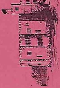
LEEDS CASTLE TURN